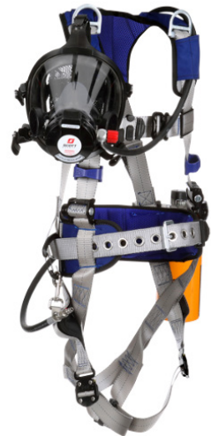
3M™ Scott™ Ska-Pak Plus Supplied-Air Respirator with Full Body Harness