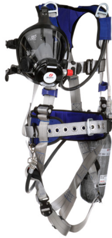
3M™ Scott™ Ska-Pak AT Supplied-Air Respirator with Full Body Harness